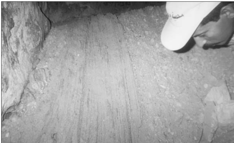
Fig. 1 – Bat Cave, Wadi Degla Protected Area. Stratified cemented fills from post-karsti- fication marine transgres- sions.

The Mokattam karst is formed on a dissected limestone plateau on the eastern fringe of metropolitan Cairo. Here, typical karstic pollution and subsidence problems have necessitated broader studies than in most Egyptian karsts (e.g., El-Ramly, 1997). In addition, recent designation of the Wadi Degla Protected Area (the equivalent of a national monument in the USA) has focussed attention on small but remarkably varied caves of phreatic origin, which are the principal expressions of its karstification. One is a typical tubular conduit cave. Another descends steeply to a vertical shaft where initial reconnaissance had to be halted. This karst has been subjected to repeated marine transgressions since onset of speleogenesis (Fig. 1). A sequence of partially cemented stratified littoral fills is present in several of these caves (Halliday, 2000a) (Fig. 2).