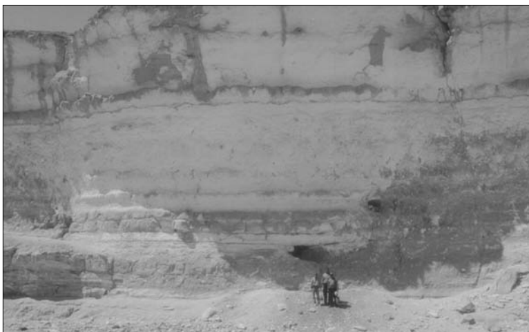
Fig. 2 – Stratigraphic section, Wadi Degla Protected Area. Two entrances of Beetle Cave are included. (Photo W.R.H).