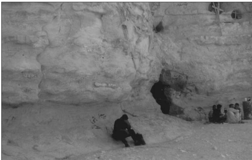
Fig. 3 – Entrance of St. Anthony's Cave and nearby karstic features. (Photo W.R.H).

Several significant karstic features have been identified on the north end of the Southern Galala Plateau in the hyperarid Eastern Desert. Here, St. Anthony's Cave is very small but significant geologically as well as culturally (Halliday, 2000, 2001). It is a fossil resurgence cave in a comparatively dense Eocene limestone. The entrance is about 2.5 m high and 1 m wide (Fig. 3). A floor of nearly colorless flowstone - possibly Egyptian alabaster (see below) - extends outward as a shelf.