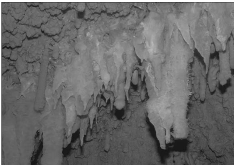
Fig. 6 – Complex speleothems in Wadi Sannur Cavern.